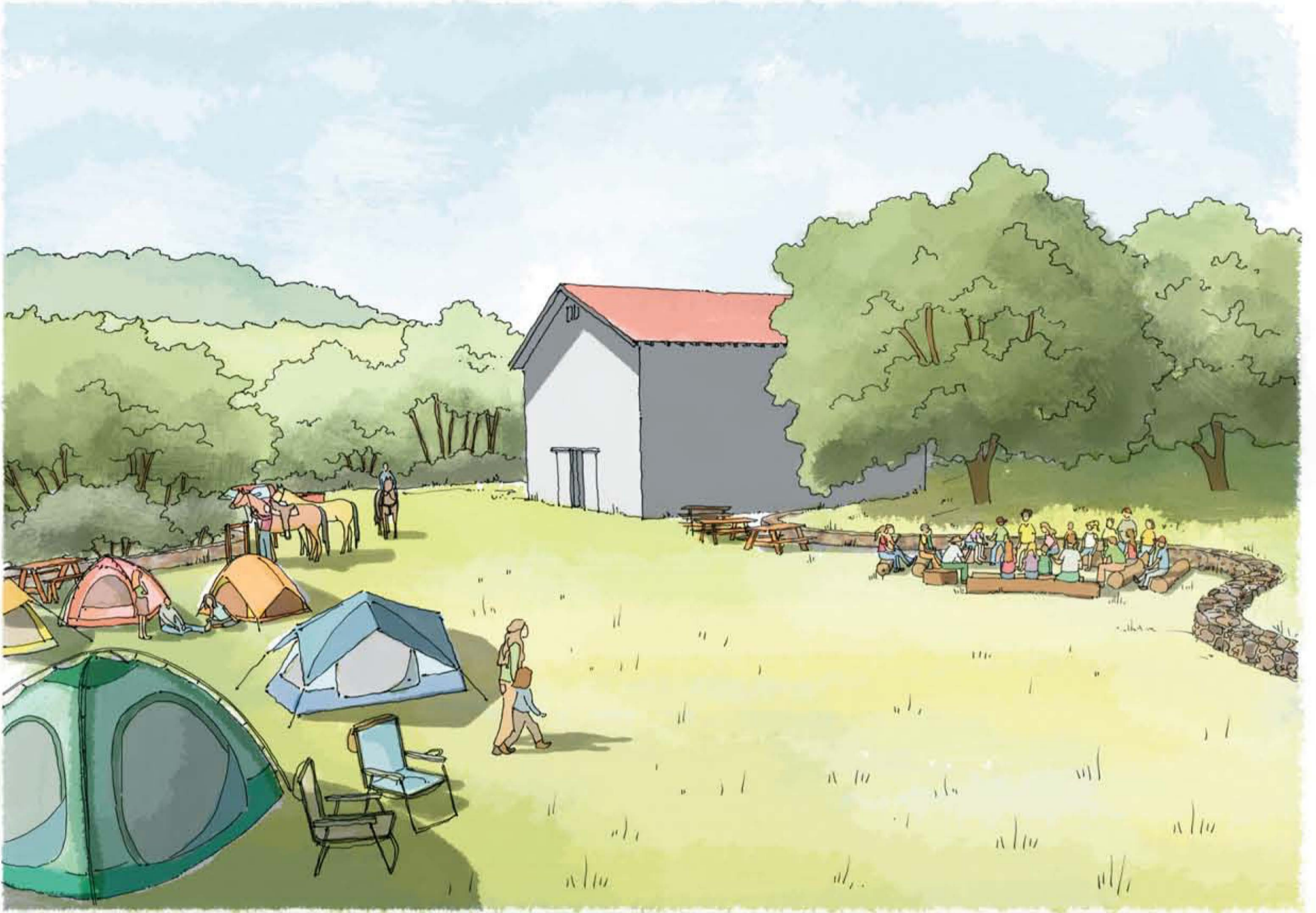
View of barn from the camping area with council-ring/outdoor classroom at right