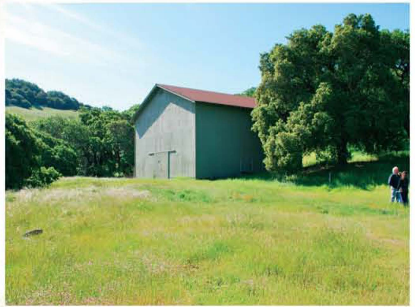
The barn area as it looks today